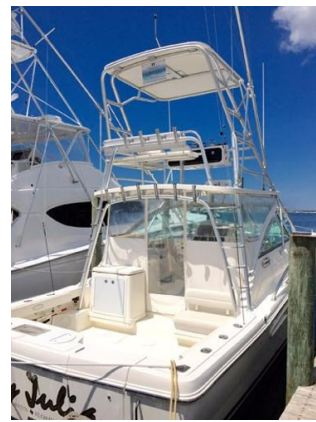
Stbd Aft Qtr