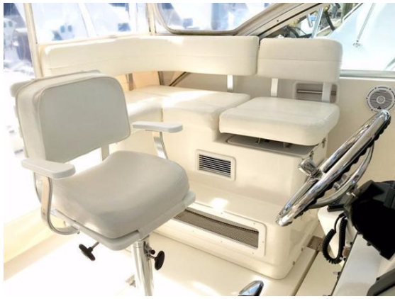
Bridge Deck Seating